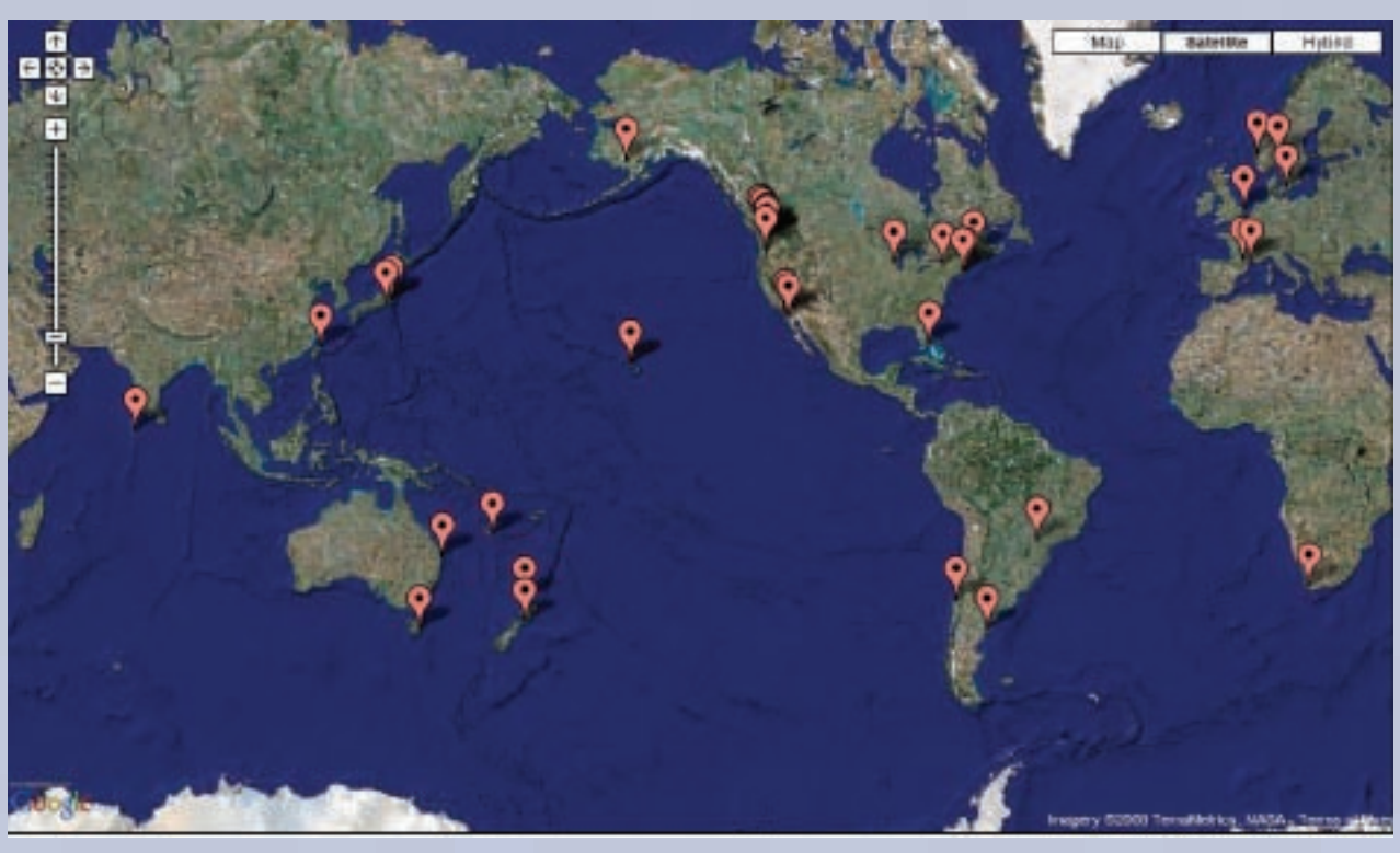
Institutions where ADMB is used. http://admb-project.org/user-base.html

Applied to management and conservation of more than 150 different sensitive endangered species and commercially valuable fish stocks around the world.